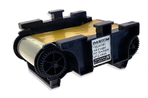
Compact ribbon cassette for easy handling

Jiangmen Dascom Computer Peripherals Co., Ltd. No.399, Jinxing Road | Jianghai District | Jiangmen City Guangdong Province | CHINA Tel.: +86 0750-3868008 | Fax: +86 0750-3868011